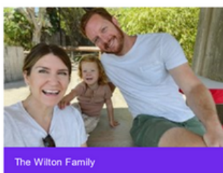
The Wilton Family

Wear any shade of purple to show your support!