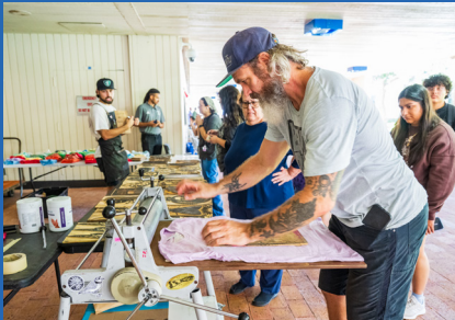
Banned Books Week

2024 was a wonderful year filled with events, panels, displays, and activities! Here are some highlights.