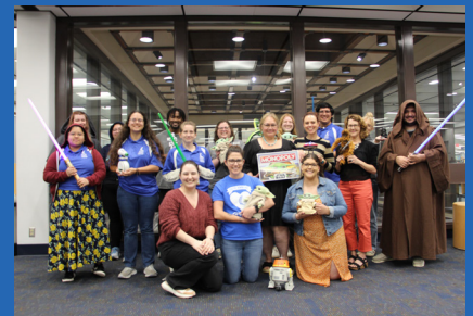
Star Wars Day