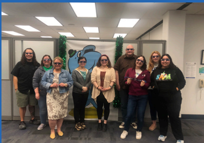
Solar Eclipse Event