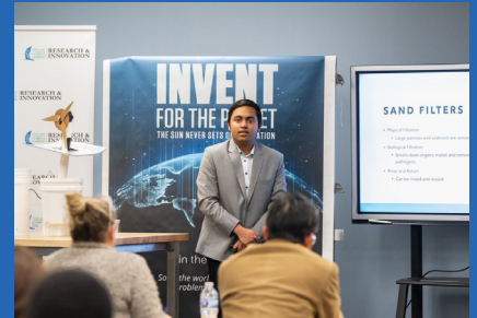
Invent for the Planet