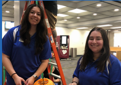
Islander Homecoming Decorating