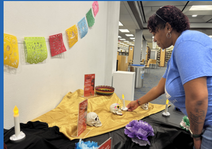
What is an Ofrenda?