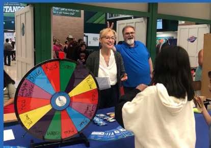
Family Literacy Night