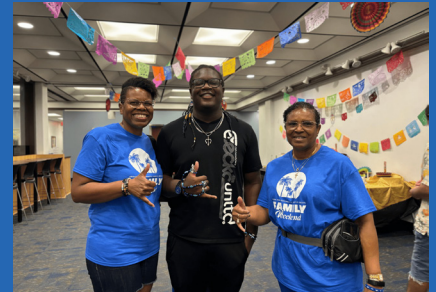
Islander Family Weekend