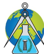
Exhibit & Presentation Guidelines (grades 6-12)

TEXAS A&M UNIVERSITY-CORPUS CHRISTI COASTAL BEND REGIONAL SCIENCE FAIR sciencefair.tamucc.edu